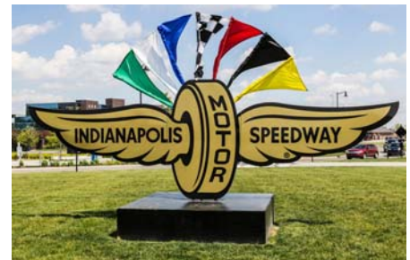
That's What I Like About Indianapolis!

For a chance to enjoy the best of the CAOG, including old friends and new acquaintances, reserve these dates now and make your travel and room reservations immediately. Indianapolis is always fully booked for fall festivities.