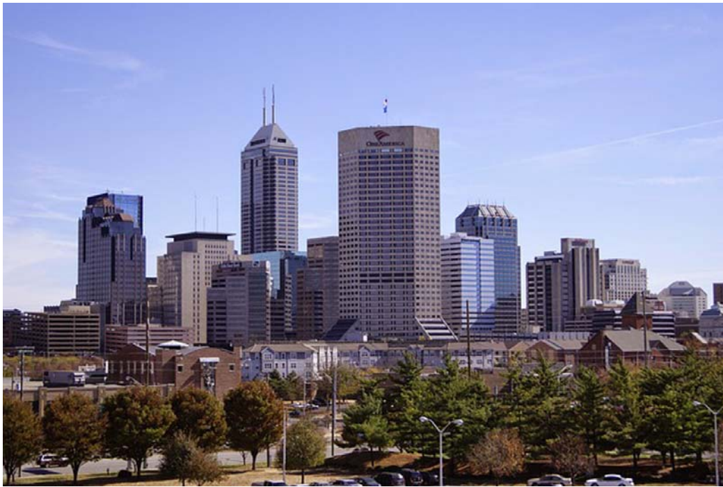
Visit Historic Downtown Indianapolis