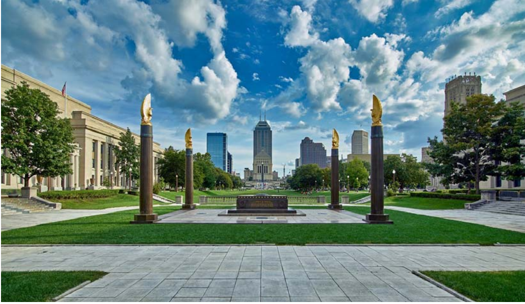
Indianapolis War Memorial