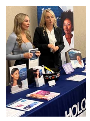
Industry friends and supporters help make our meeting possible