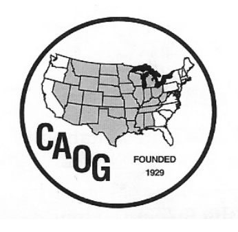
Great Science + Great Venue = A Great Meeting