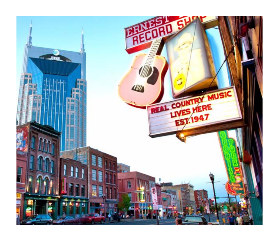
Visit Historic Downtown Nashville – Music City U.S.A.