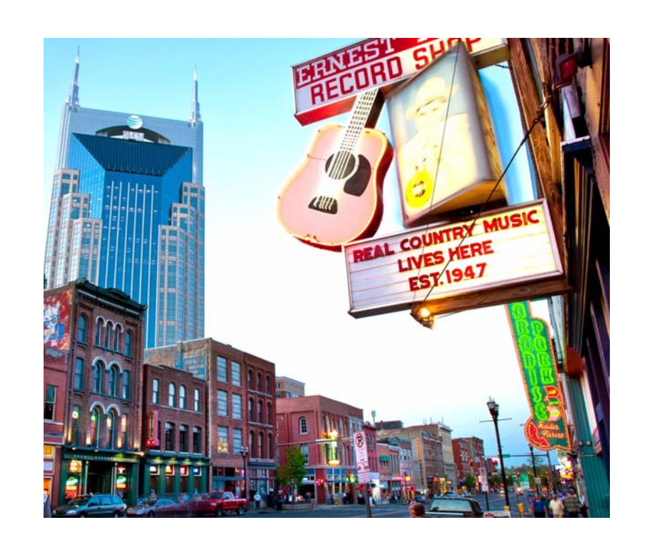
Visit Historic Downtown Nashville – Music City U.S.A.