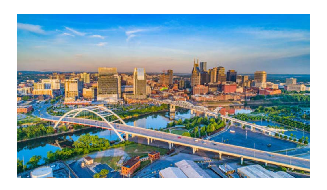
Beautiful Nashville, Tennessee Skyline