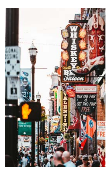
Busy Lower Broadway Downtown Nashville

Provisional active members must attend at least one Annual Meeting following election to become a full Active Member. Active Members are encouraged to attend at least one Annual Meeting every three years. These are minimum attendance recommendations. The CAOG encourages members to consider annual participation. Make CAOG your priority.