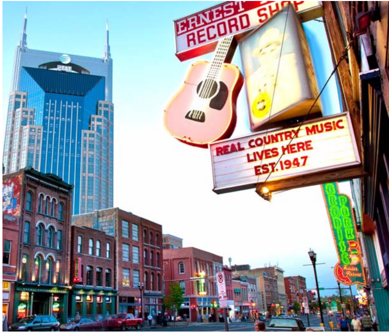
Visit Historic Downtown Nashville – Music City U.S.A.