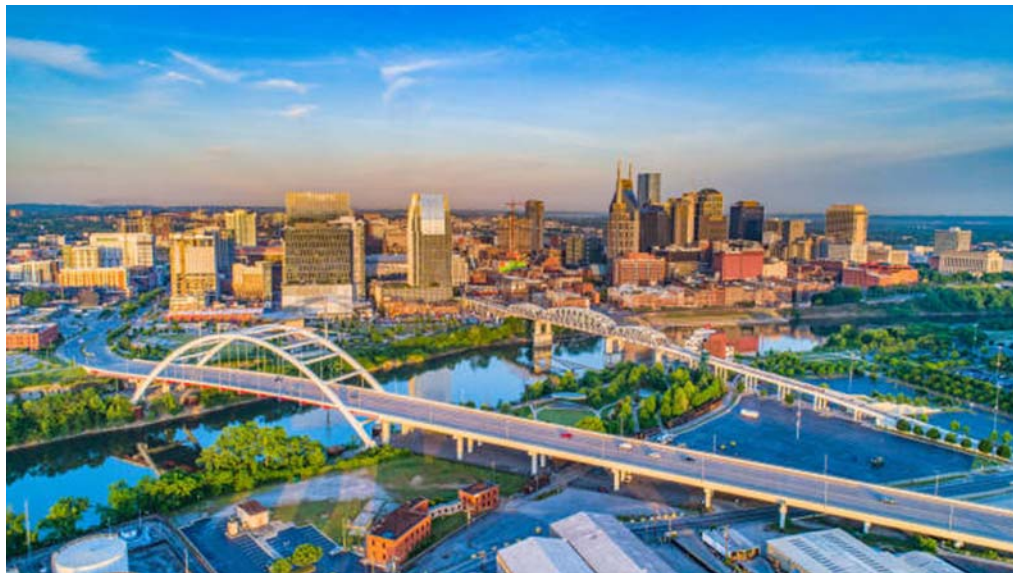
Beautiful Nashville, Tennessee Skyline