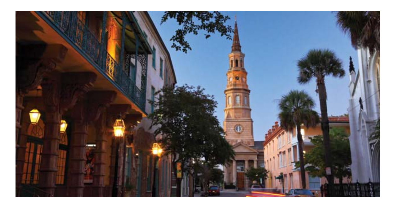
Charming & Historic Downtown Charleston – Founded 1670