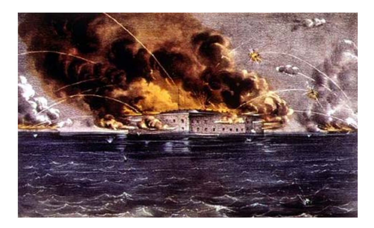
Fort Sumter, Charleston, S.C. – Civil War Began Here