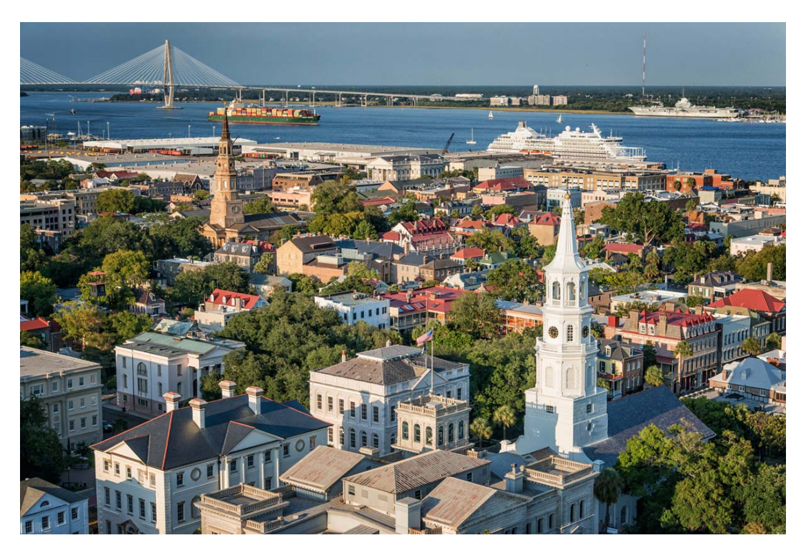
Welcome to Charleston, S.C. – Ranked #1 in Southern Hospitality !